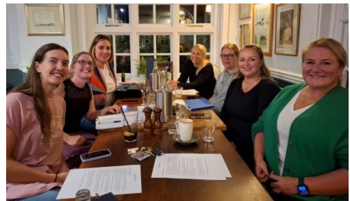
PTA helpers WhatsApp group